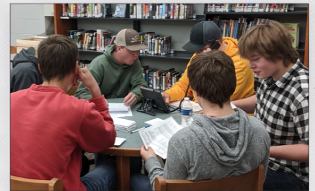
DFS Students Calling for Phone-A-thon