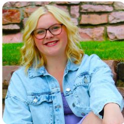
Sidney Kvam Augdahl Memorial Scholarship, DFSPS DFSSS