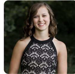
Anna Bergman Greg Goldenstein Memorial Scholarship DFSPS, DFSSS