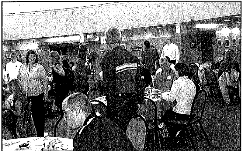
The 2009 annual spring awards luncheon.

Excel Plastics of Fergus Falls committed to the creation of a scholarship that will be awarded an-